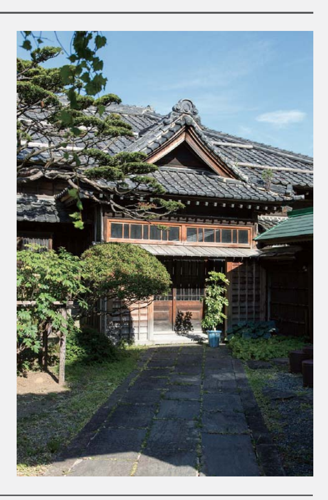
Location:4-9 Sumiyoshi-cho, Otaru Built:1906(Meiji 39) Structure: 2 story timber structure building

Magohachi Inomata the second, built the residence in Ironai 1-chome, but the building burnt down in the Ironai Fire of 1904 (Meiji 37). The residence was rebuilt in its current location on a hill south of the Irifune Nanasaro Intersection. The first thing that catches the eye is the gated stone fence and kura, made from stones cut out of Mt. Tengu, which were built for fire prevention. It is said that the design of the gate came from a sketch the owner did while visiting China. Overall the residence is built in authentic Japanese style and architecture, with the exception of the Western styled living room built on the left side of the entrance. Shirokiya Department Store in Tokyo was commissioned to design the interior and carpenters were hired from Niigata to do the construction.